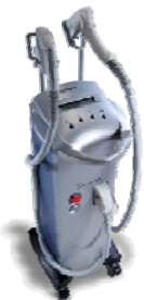
a complete elōs facial solution