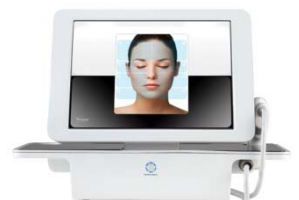
Portable skin resurfacing system

Syneron's addressable market has grown 20 fold from 50,000 potential users in the mid 90's to more than 1,000,000 potential users now