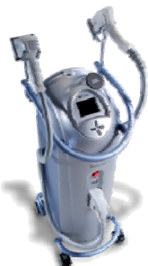
Diode laser elōs technology