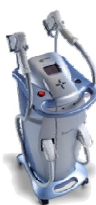
a complete aesthetic elōs workstation